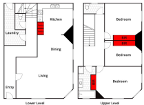
2/402 Doveton Street North, Soldiers Hill

Section 47AF of the Estate Agents Act 1980